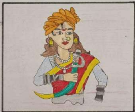
Rani Lakshmi Bai